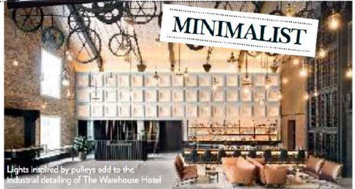
Lights inspired by pulleys add to the industrial detailing of The Warehouse Hotel