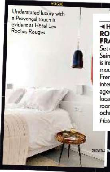
Understated luxury with a Provençal touch is evident at Hôtel Les Roches Rouges

Set on the rocky coast of Saint-Raphaël, the hotel design is inspired by the clean nautical-modernist lines of the 1950s French Riviera—with stark white interiors complemented by aged oak, polished concrete and local terracotta ceramics. The rooms have pops of orange, ochre, lemon yellow and blue. Hotellesrochesrouges.com