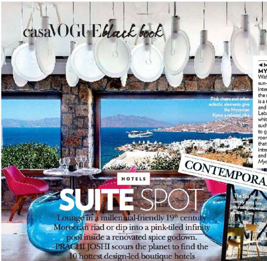
Pink chairs and other eclectic elements give the Myconian Kyma a relaxed vibe