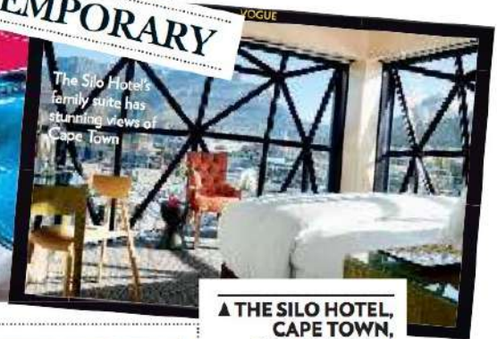
The Silo Hotel's family suite has stunning views of Cape Town

Lounge in a millennial-friendly 19 th century Moroccan riad or dip into a pink-tiled infinity pool inside a renovated spice godown. PRACHI JOSHI scours the planet to find the 10 hottest design-led boutique hotels