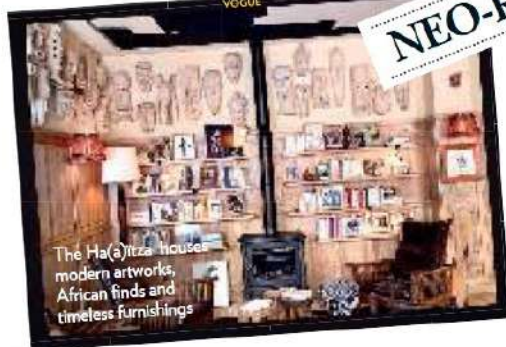
The Ha(a)ïtza houses modern artworks, African finds and timeless furnishings

The 1930s neo-Basque architecture of Ha(a)ïtza has been reimagined by Philippe Starck to give the historical building in France a modern sophistication. Referencing the Dune du Pilat (Europe's tallest sand dune), the rooms are done up in light wood and white tones with a touch of steel and glass, while the pinewood walls in the lobby, the African masks in the lounge and artist Ara Starck's coloured windows in the reception add drama. Haaitza.com