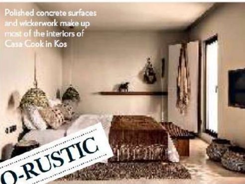
Polished concrete surfaces and wickerwork make up most of the interiors of Casa Cook in Kos

The hotel has been designed to resemble a traditional Greek village, with its mix of one- and two-storey villas built in the local cubist style. The interiors of the 100 rooms have polished, pale grey concrete surfaces offset by furniture in wickerwork, and furnishings in muted browns. Inspired by the concept of paréa where you live with family and friends, the villas have been arranged around a series of shared courtyards. Casacook.com