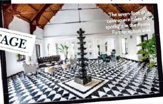
The seven-foot dya centerpiece takes the spotlight in the Ayana Fort reception area

Set in the heart of the red city, L'Hotel Marrakech is a 19th-century riad, lusciously redecorated by English designer Jasper Conran. His first hotel reflects his Occidental design sensibilities with its whitewashed walls, soothing colours and billowing white voile curtains. The mashrabiya windows, zouak ceilings, zellige tile work and profusion of orange trees in the central courtyard add the requisite Moroccan flourish. L-hotelmarrakech.com