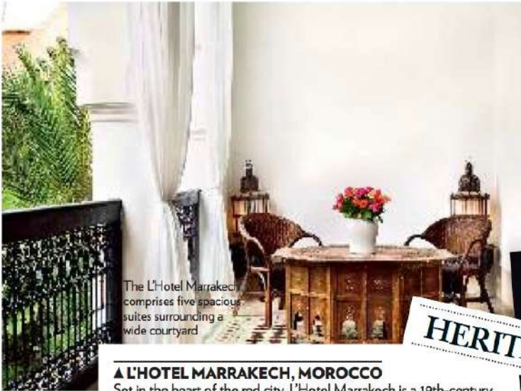
The L'Hotel Marrakech comprises five spacious suites surrounding a wide courtyard