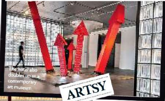
The hotel also doubles up as a contemporary art museum

21c Museum Hotel is built in a building that was once a Ford assembly plant, and includes a contemporary art museum and a 135-room hotel. The design integrates the building's automotive legacy by restoring and recreating original assembly line elements such as the decorative brick and terracotta exterior sconces, and uses reclaimed wood and plastic for the furnishings. 21cmuseumhotels.com